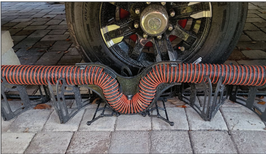
Legs positioned in the LOW height setting.

Pull the sewer hose support away to make room for the RV Snap Trap™. The RV Snap Trap™ may be installed at any point within the sewer hose support run. The legs may be omitted as they are not required.