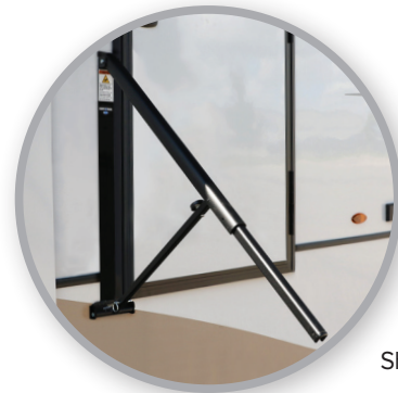
SP56-573 Short Safe-T-Rail